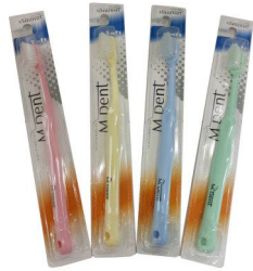
Toothbrush soft by M-Dent