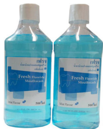
Fluoride Mouthwash 0.05% 250/500 ml (Mint)