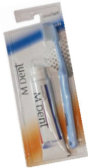
M-Dent package Toothbrush and Toothpaste 40 g