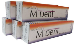
Toothpaste 100 g Soft Cool by M-Dent